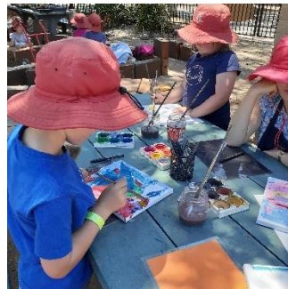
Making gifts for families