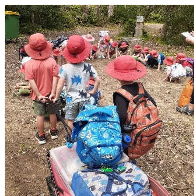
Going on many adventures