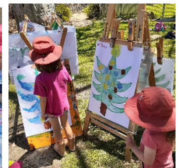
Preparing for the end of the year