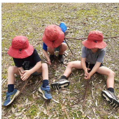
Learning new skills

Dear Weelam group, I began this newsletter down at Bush camp sitting in my van listening to Waang and waiting for families to arrive with a feeling of gratitude that we would be able to gather as a group and be together in this special place. As I now complete this, I find myself reflecting on the beautiful Celebration gathering we had at the Preschool yesterday. Your kind words, your thoughtfulness, the joy of the children and the many stories and connections between us. After what has been another challenging year globally it was terrific that as our time together came to an end, we have been able to share these times together in what have been important learning spaces for us all. Enjoy reading this final newsletter for 2021. There are so many stories within each photo. Thankyou for supporting us to create all these stories with your children. We all take many wonderful memories with us from this past year together.