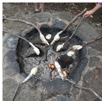
Damper on the campfire