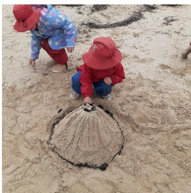
Finding possibilities within nature