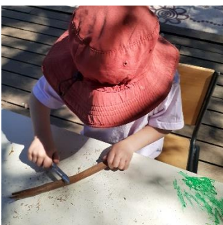
Making a digging stick