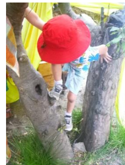
*solving how to get back down again.

Smoking ceremony: Thank you to everyone who attended and helped make our new Womin djeka sign. The sign will be placed on our outside wall at the next maintenance day. It looks fabulous with all the discoveries. To assist us all to learn more about First Peoples symbols and meanings I have included this information here. “In a Smoking Ceremony, leaves of three plants may be used – Cherry Ballart (ballee), River Red Gum (biel) and Silver Wattle (muyan). The cherry ballart is a plant that requires support when young but has strong resilient wood. The cherry ballart symbolises youth. The wattle was vital to local clans, every part being used: seeds, bark, wood and gum. It represented the elders. The red gum is the most widespread eucalypt in Australia and is symbolic of the entire community and the community’s access to the land and its resources. As you walk through this smoke, you are also walked through and protected by a physical merge of the old and the new. Smoke cleanses the visitor, and was a ritual to discourage bad intent.