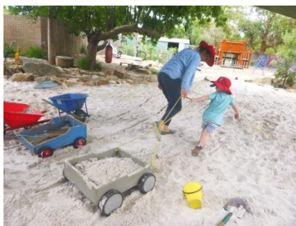
*working helping to move the sand