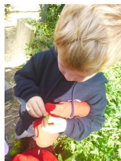
*trying new tastes