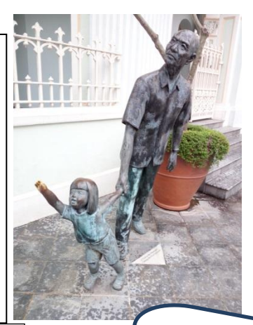
This beautiful statue in front of the museum was titled: Bringing the past forward. I found this a powerful message to reflect on for children.

Here I am in front of the 'Kindness shop' with the 'Kindness' friends. Singapore are teaching their nation these values, not just the children.